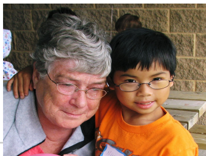
types and causes of loss