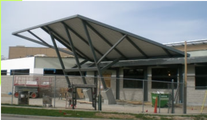
The new entrances to the Boys & Girl Club - Fox Valley getting ready for June 2010 opening

OPEN HOUSE Tuesday, August 17th 4:30 - 6:30 PM