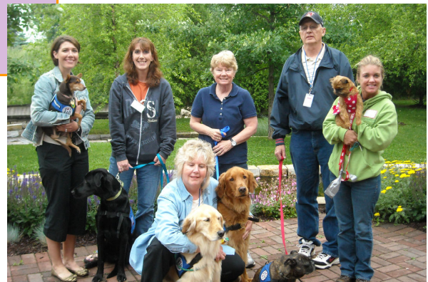
Pictures from our CGC Memorial Picnic at the Gardens of the Fox Cities